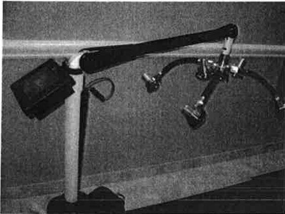
Fig. 1. The prototype LLLT device used in this study utilized six 532 nm green diodes. Each diode had a mean power output of 17 mW and the total output of the six diodes was 102 mW. Based on the randomized treatment for each patient, the Investigator pushed one button on the device which turned on the active 17 mW, 532 nm laser or the button which activated a sham 1.25 mW, 532 nm green light-emitting diode (LED). When activated, the sham LED light is indistinguishable from green laser light.