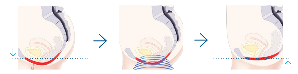
Figure 1: HIFEM technology mechanism of action

For its myostimulative effect, the method is used in pelvic floor muscles strengthening in order to adress the SUI. The patient affected by the SUI is not able to contract pelvic floor muscles selectively, therefore HIFEM represents targeted pelvic floor muscles strengthening and re-education. As the electromagnetic field passes through human body non-invasively, therapy is delivered